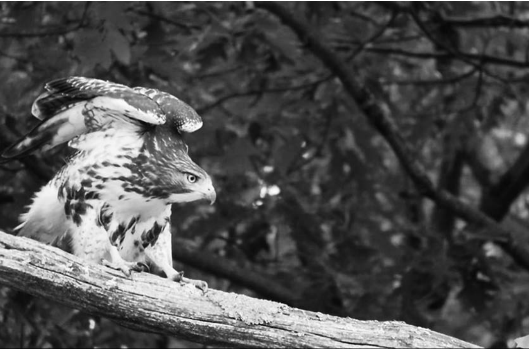
Left: A fledgling Red-Tailed Hawk tries out its wings at Oak Hill Subdivision.

“ Oh, Sunlight! The most precious gold to be found on Earth.”