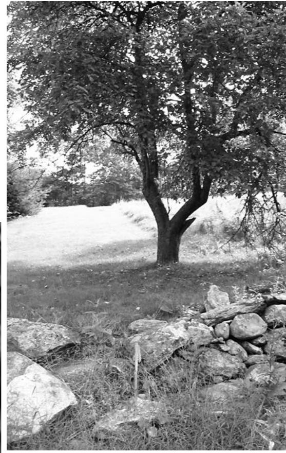
Above: Field at Henrickson Orchard.

But White Oak is always trying to be proactive in conserving open space and managing the land we already own. Another exciting project in the pipeline would preserve one of Holden's two bogs. And a new gravel parking lot is being built on Salisbury Street for access to the public open space at Oak Hill subdivision. 🌿