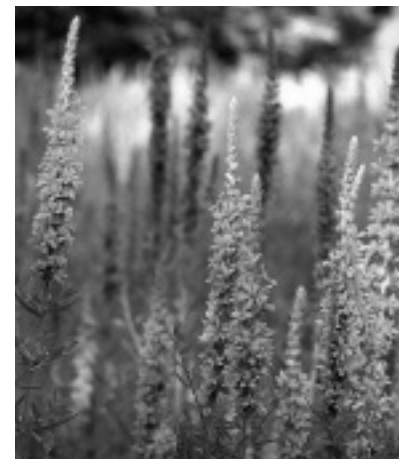
Purple loosestrife ( Lythrum salicaria )

“I cannot endure to waste anything so precious as autumnal sunshine by staying in the house.”