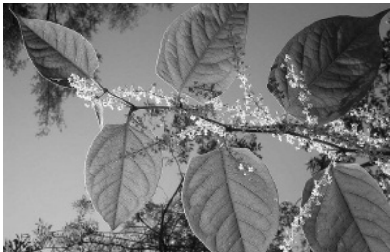
Japanese knotweed ( Polygonum cuspidatum )

Light refreshments will follow the meeting. This event is free and open to all! 🌿