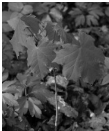
Norway maple ( Acer platanoides )